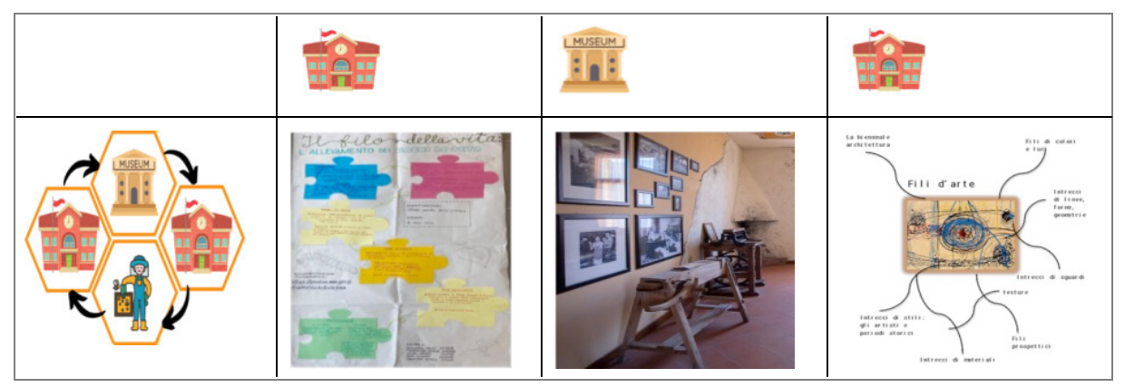
Figure 4. A formative continuum example: school and museum activities.

Two hundred and fifty pre-service teachers have experienced how Biology immersion can be set in schools, starting with indoor and outdoor activities while approaching a certain topic and stimulating learners to raise questions, shifting through museums to deepen knowledge, make complement experiences, use specific tools and alternative research methods, then coming back to schools to continue building knowledge through laboratory activities, and eventually letting experts to access the schools in order to enforce the osmosis between different form of knowledge and expertise into the learners' daily setting (Fig. 4).