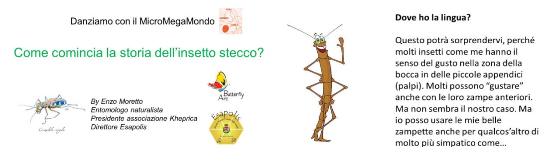
Figure 5. An example of material available to parents or teachers

The scientific director of the Esapolis museum noticed some positive outcomes too. With respect to the students, he appreciated their own peculiar way of experiencing the museum even with their own fears; he thinks that students have developed skills to relate to living organisms (some of them are easily bred at school, even in an autonomous way), and they elaborated ideas to be developed in continuity with their museum experiences. With respect to the Athenaeum, the project in his opinion was a valuable opportunity for dialogue and discussion on museum teaching. Nevertheless, Esapolis has been currently collecting data and feedback by the young visitors, who have experienced the museum itineraries drawn by pre-service teachers during the Biology Lab, and their accompanying adults. The aim of this 5th phase in fact is to check the effectiveness of these itineraries, especially in terms of ability to generate interest and adopt Carson's perspective: "if a child is to keep alive his inborn sense of wonder, he needs the companionship of at least one adult who can share it, rediscovering with him the joy, excitement and mystery of the world we live in [10]. Afterwards, some materials are going to be available to the children's carers, whether parents or teachers, to create connections and a positive interdependence between formal, non-formal and informal systems (Fig.5).