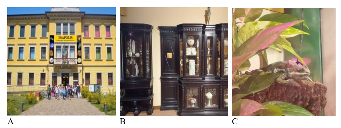
Figure 1. Esapolis, Museum of the MicroMegaWorld in Padova. In succession: A. The exterior of Esapolis. B. An example of the historical collections. C. An example of living animals in cases.

There are also living exhibits of insects, arachnids, reptiles, amphibians, fish and many other small creatures that constitute the largest animal biomass on our planet (Fig. 1C).